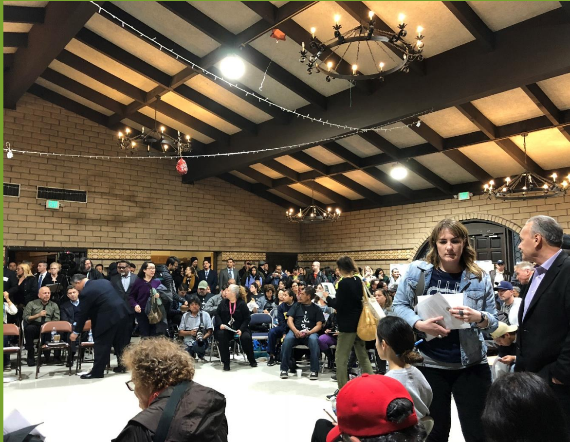
Neighborhood Council Meeting 2018